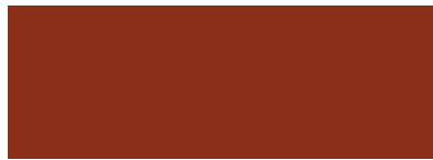
Barn Red LF13