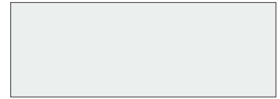
Bone White LF06