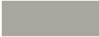
Light Gray LF04