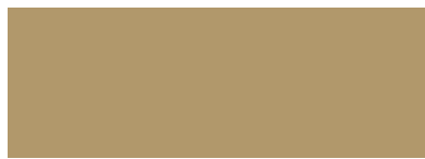
Western Tan LF07