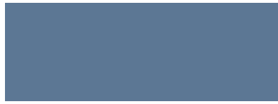
Slate Blue LF01