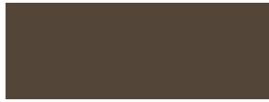
Medium Bronze LF02