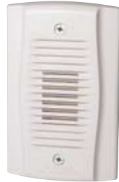
MHW UL S4011