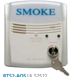
RTS2-AOS UL S2522