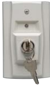
RTS151KEY UL S2522