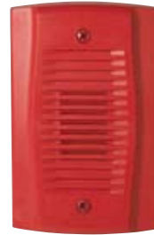
MHR UL S4011