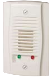
APA151 UL S4011