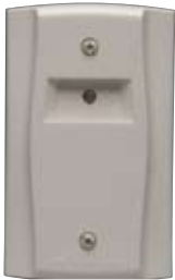
RA100Z UL S2522