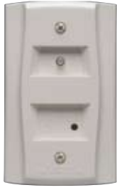
RTS151 UL S4011

System Sensor provides system flexibility with a variety of accessories, including two remote test stations and several different means of visible and audible system annunciation. As with our duct smoke detectors, all duct smoke detector accessories are UL listed.